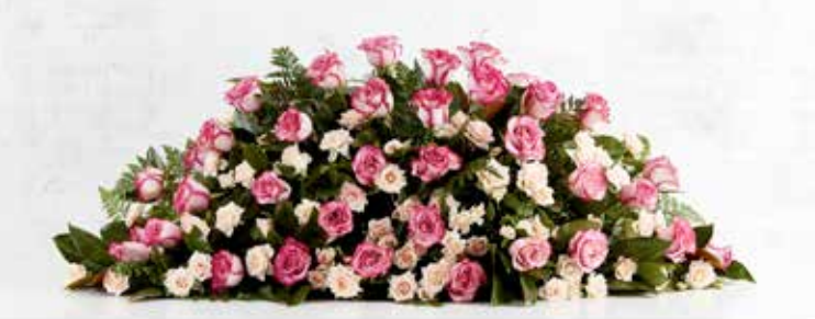
C05 - Long Stem & Pink Spray Roses S -$500 M -$600 L -$700