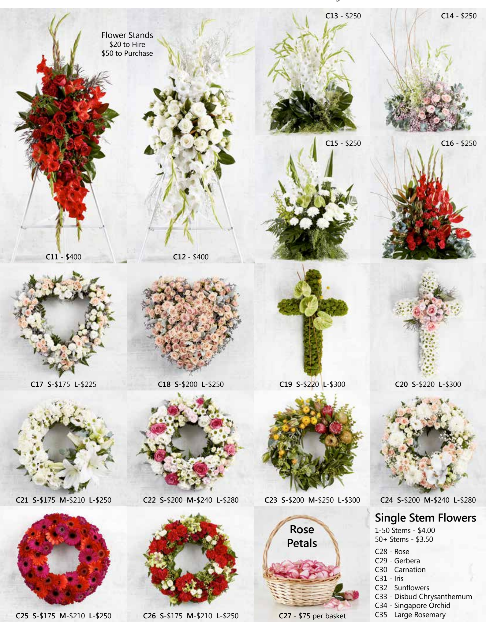
Delivery & GST included - receive 5% discount on flower orders when added to a catering order. Wreaths: Diameter - Small 40cm - Medium 50cm - Large 60cm