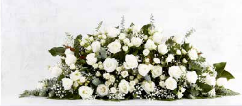
C02 - Long Stem & Spray Roses