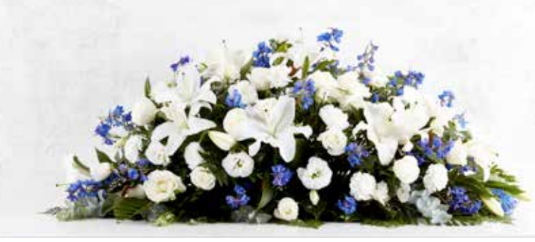
C08 - Lily, Delphinium & Roses