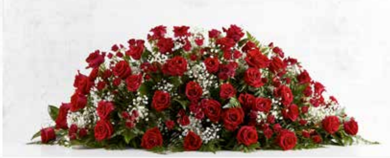
C06 - Long Stem & Red Spray Roses S-$550 M-$650 L-$750