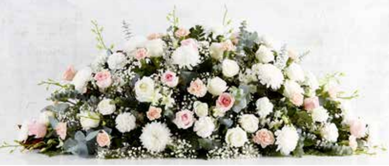
C07 - Disbud, Orchid, Roses & Carnation S-$450 M-$550 L-$650