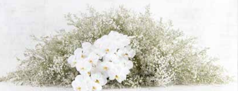
C03 - Phalaenopsis Orchid & Misty S-$500 M-$600 L-$700