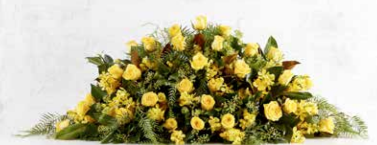
C04 - Roses & Orchids