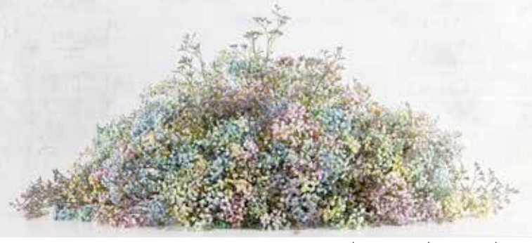
C09 - Pastel, Baby's Breath & Misty S -$300 M -$400 L -$500