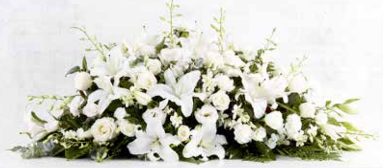
C01 - Lily, Orchids & Roses

Delivery & GST included - receive 5% discount on flower orders when added to a catering order. For a full flower range, please ask for a copy of our Flower Brochure. <u>Casket Sprays</u>: <u>Height</u> - all approx. 33cm / <u>Length</u> - Small 1m - Medium 1.2m - Large 1.4m